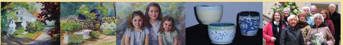
Attleboro Garden Club Members

Country Gardens is on the Attleboro/Rehoboth line, off Route 118, look for the event signs or for directions log on to http://www.countrygardens.ws/directions.php# or call 508-431-1255