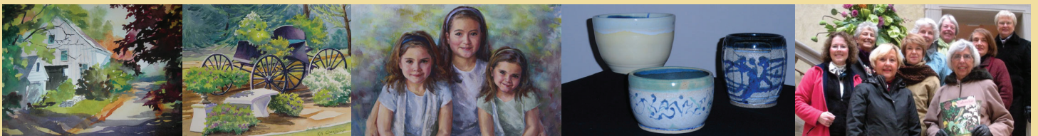
Attleboro Garden Club Members

Country Gardens is on the Attleboro/Rehoboth line, off Route 118, look for the event signs or for directions log on to http://www.countrygardens.ws/directions.php# or call 508-431-1255