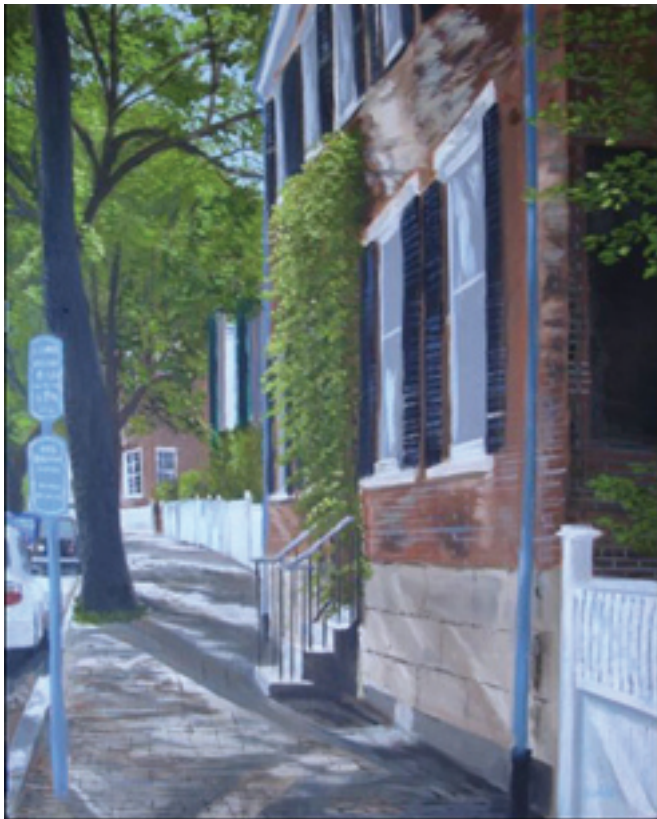
Bill Noble Walking Nantucket Oil on linen