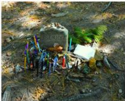
Homage To Henry ~ Thoreau's Grave Sleepy Hollow, Cemetary Concord, MA