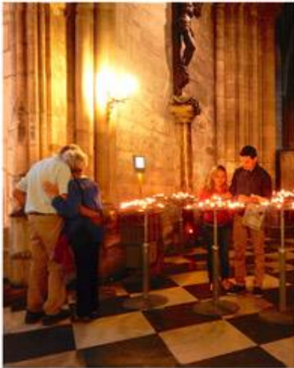
Candles For Comfort, Candles For Hope Notre Dame, Cathedral, Paris France