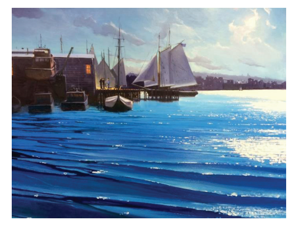
Wharf Business, Gloucester

"He is one of those rare individuals that is not only a good painter but, a committed and creative teacher, as well." International Magazine