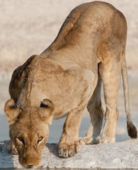
EXHIBIT WILL BE ON DISPLAY NOV. 5-30TH

THE FRANKLIN ART CENTER 5 MAIN ST. FRANKLIN 508-887-2797