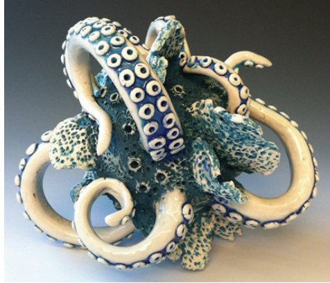
"Tentacled Undulations" by Erin Patterson

All media accepted in any style, not to exceed 18" L+W. 3-D not to exceed L+W of 8" by H of 10" or the equivalent